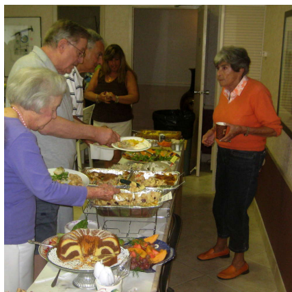
New Year's Day 2009

However, all is never lost and the south Florida weather changes so fast that before you know it the sun comes out and we are once again living in paradise.