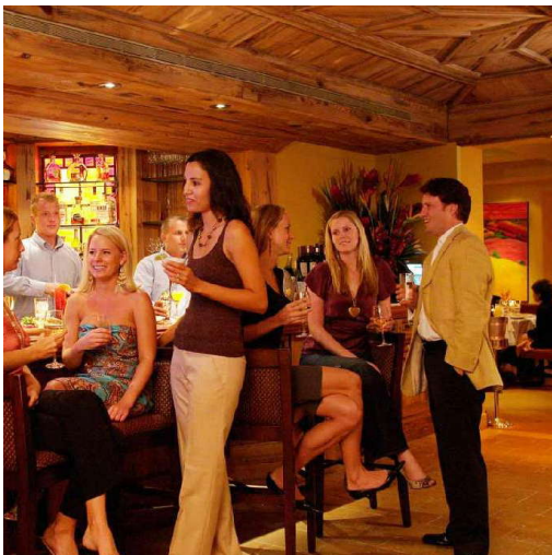
The Bar at Café Boulud

The food at these affairs has gone upscale. Most of the preparations go way beyond 'burgers and 'dogs. Fancy lamb and interesting marinades for beef have become the order of the day.