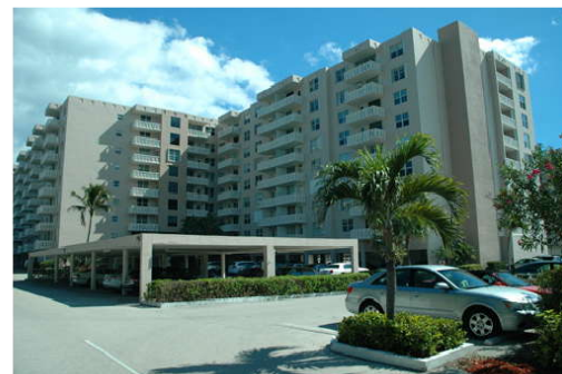
Looking Good for the Season