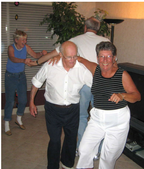
Twist and shout at the hop